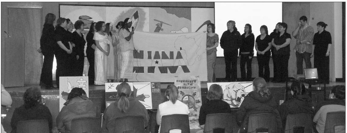
January 28, 2010 – “Multiculturalism and Diversity” on the stage of the College of The North Atlantic.

Chair-Multicultural Awareness Committee and Inuit Education Coordinator